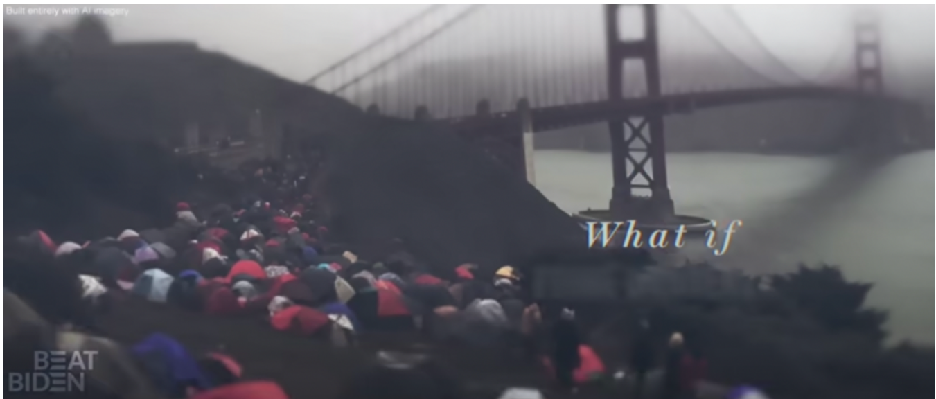
Figure 1. Ad released by the Republican National Committee imagining life under a second Biden administration.

While we are likely to see additional examples as the 2024 primary and general elections proceed, to date there have been few confirmed examples of GAI in political ads. Yet, the examples provide some indications of how campaigns plan to use GAI to advance their objectives. Based on our observations, we group them into three main categories: publicity, alteration, and fabrication.