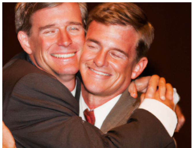
Figure 4b. DALL-E 2 image of US Representatives Greg Stanton (AZ-D) and David Scheikert (AZ-R) hugging.