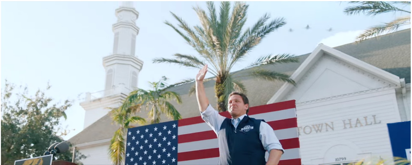
Figure 2. Ad released by DeSantis-aligned PAC. The jets were likely added to the video.