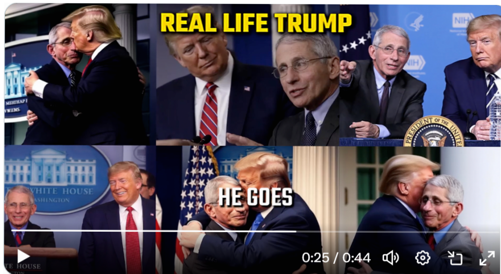
Figure 3. Ad released by the DeSantis campaign that included false GAI images of Donald Trump and Anthony Fauci hugging.

In June 2023, the DeSantis campaign released an ad that included GAI images of Donald Trump hugging Anthony Fauci. The still images were included alongside real images of Trump and Fauci together ( Figure 3 ).