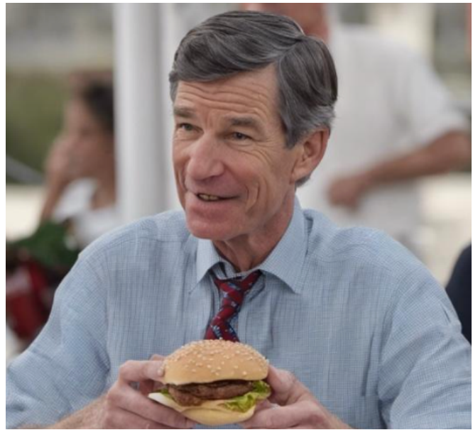
Figure 5b. Stable Diffusion-created image of NC Governor Roy Cooper eating a hamburger.

Commentators suggest that new GAI-based tools will make it far easier and cheaper for advertisers to create false content. Photo manipulation has existed as long as photographs and this problem has increased in prominence with the introduction of deep fake technology.