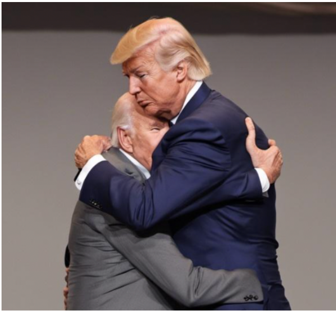
Figure 5a. Stable Diffusion-created image of Donald Trump and Joe Biden hugging.

Stable Diffusion returned images for all queries for all levels of politician, creating images of North Carolina Governor Roy Cooper eating a hamburger and of Biden and Trump hugging — although with some errors (Figure 5a).